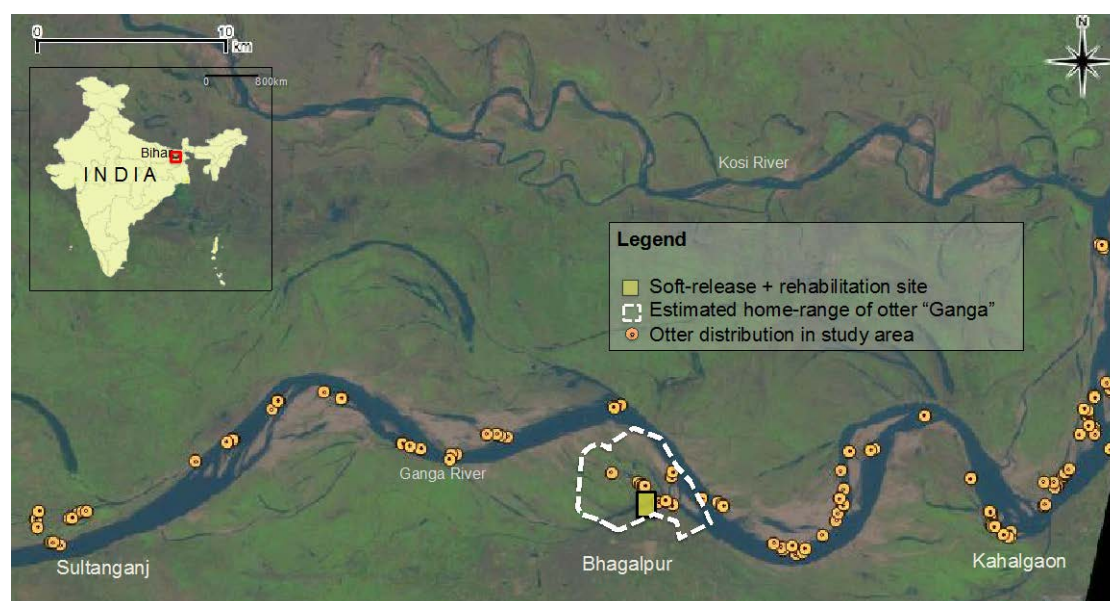
Figure 1. Map of the study area, with known locations of otter packs from field surveys (2000 to 2017) and the site selected for soft-release and rehabilitation of the otter ‘Ganga’.

Dolphin Sanctuary area; a 67 km river stretch designated for the protection of endangered Ganges river dolphins (Fig. 1). High densities of smooth-coated otters have been reported from the area. Wild otter pack sizes range from 2 to 10 animals, although we have once seen a pack of 13 otters. The river stretch has a vast floodplain with agriculture and alluvial plains, with many compound meanders, braids, alluvial islands, side-channels, and confluence zones. River thalweg depths range from 1 to 40 m, and channel widths from 200 m to 2 km. Details of the study area and reports of initial otter sightings are provided in Choudhary et al. (2006). Fishing activity is also high in this region, with a few thousand fishers of the Mallah (Nishad) caste-group dependent on the river-floodplains for subsistence. Importantly, these fishers have positive cultural perceptions about otters despite suffering regular losses from otter-caused damage of nets. Some fisher groups in the study area also revere otters. Detailed information on this can be found in Choudhary et al. (2015). Gudger (1927) in his delightful review “Fishing with the Otter” cites C.J. O’Donnell’s 1877 report that fishers of Bhagalpur and Rajmahal regularly kept otters to help in fishing, but this practice is now extremely rare, if it exists at all. We have known only one fisherman to have kept an otter as a pet, and this practice is now likely nonexistent in India.